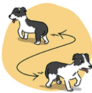
Pacing or restlessness