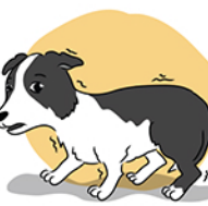
Trembling or shaking