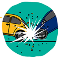
Traffic or street noise