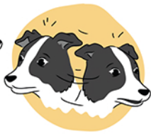
Excessive vigilance or hypervigilance