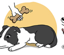
Refuses to eat