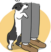
Owner seeking behavior or abnormal clinginess