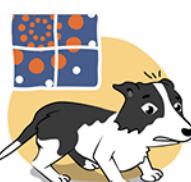
Freezing or immobility