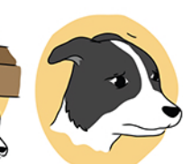
Brow furrowed or ears back